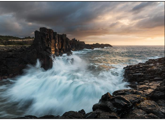
World class thinking. World class achieving.